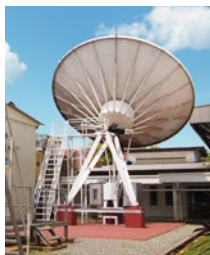
JKT01 Andrew 9M C-Band ABS-2