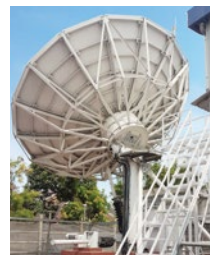
JKT03 Vertex 7.2m C-Band ABS-2