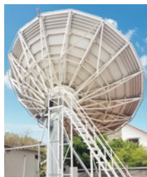
JKT09 Vertex 9M Ku-Band ABS-2A