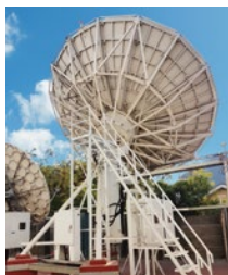
JKT08 Vertex 7.3M Ku-Band ABS-2