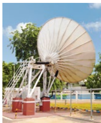
JKT02 RSI 9M C-Band ABS-6