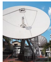
JKT04 RSI 11.2M C-Band ABS-6